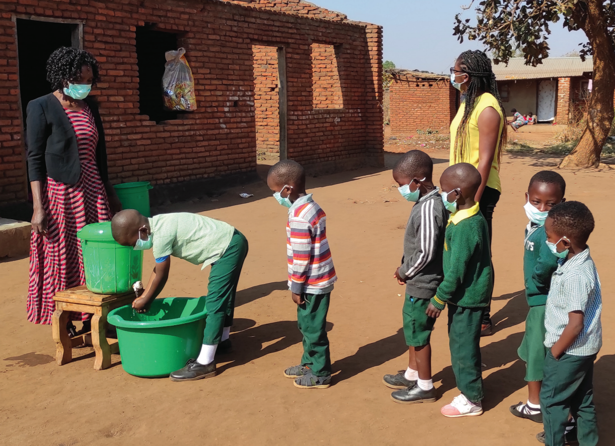
Children washing their hands before entering class