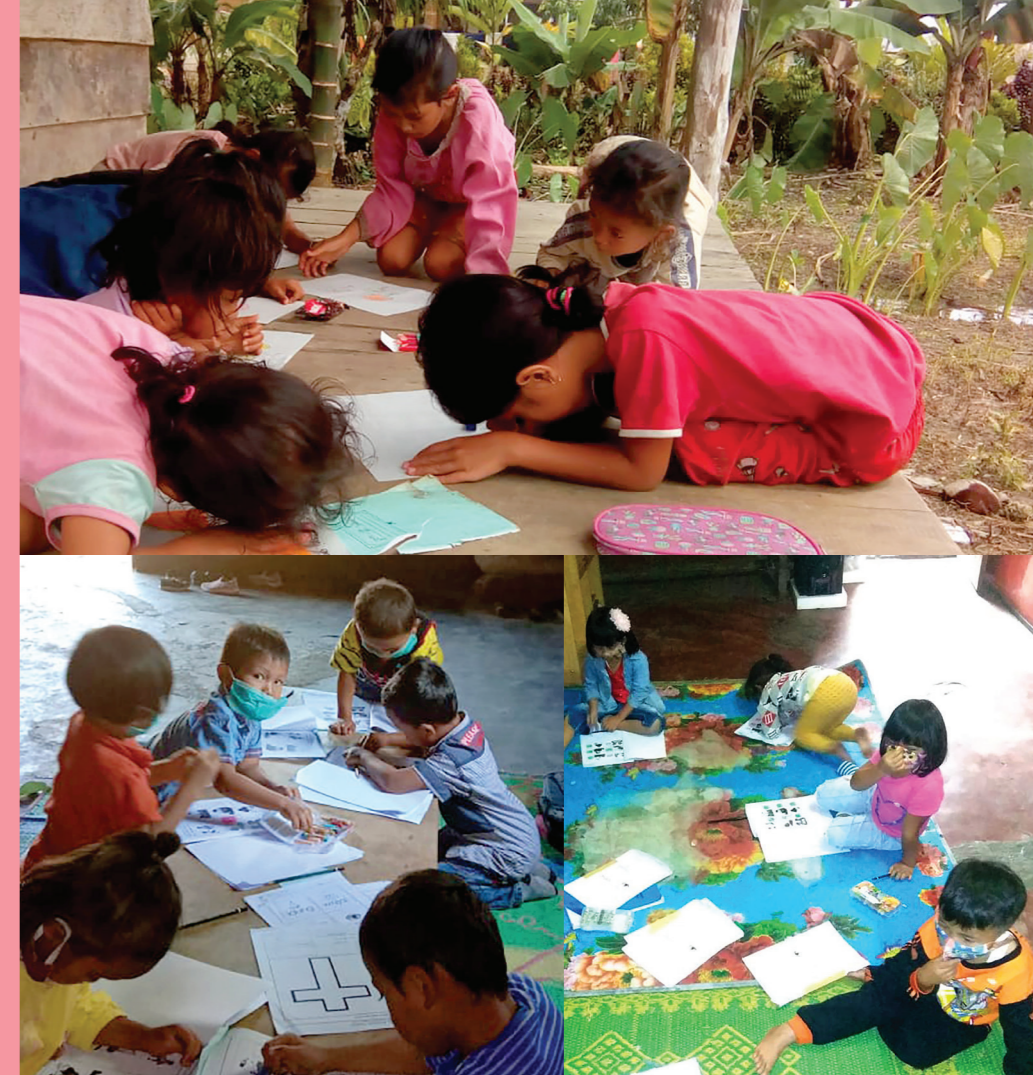
Home learning , Sumatra

This solution brought balance between the necessity to adapt education to the health crisis and the need to find a way to support parents that are not able to help their children with their homeworks. Finally in September 2021, the government re-allowed full face-to-face learning.