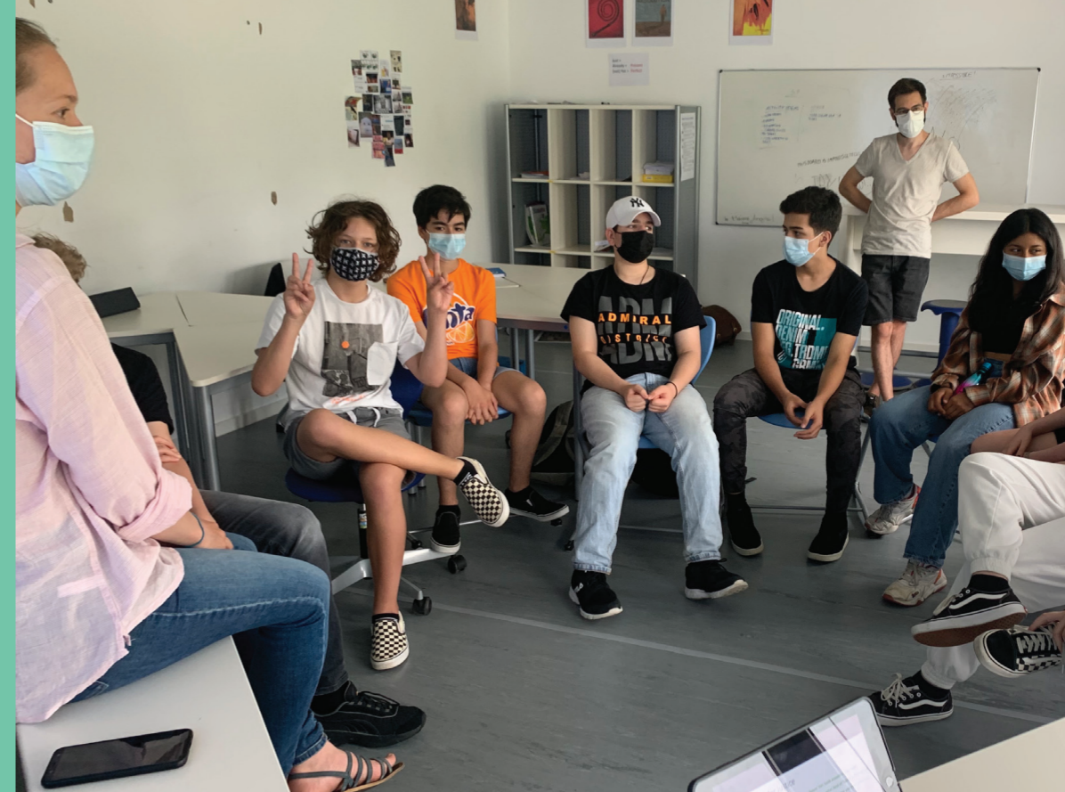
Discussion on the short film Mercy's Blessing with the students of the international school of Mondorf-les-Bains.